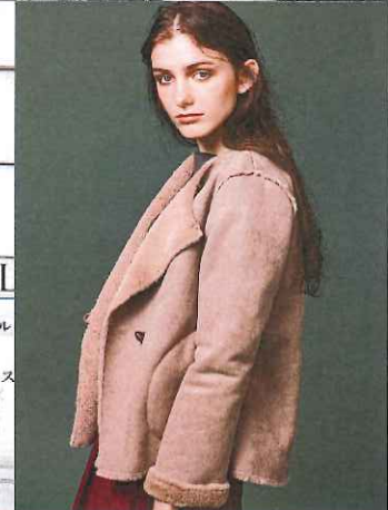
コート ¥35,000 / NAISSANCE(レイク・タホ tel:03-5708-5